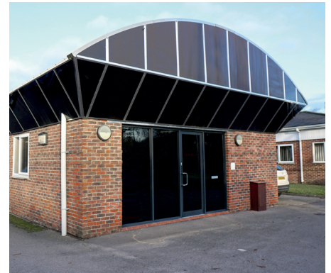
Brenmar head office

So, whatever the size or timescale of your project – be it valued at £500 or £5M – when you work with Brenmar, you'll find we still offer the same passion, integrity and flexibility as we did back in 1976, supporting you, as a trusted partner.