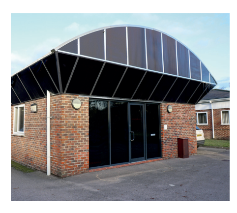
Brenmar head office

So, whatever the size or timescale of your project - be it valued at £500 or £5M - when you work with Brenmar, you'll find we still offer the same passion, integrity and flexibility as we did back in 1976, supporting you, as a trusted partner.